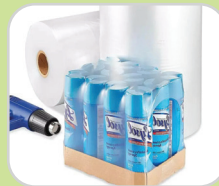
Heat shrink films