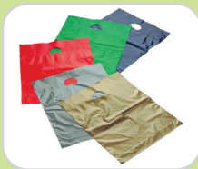
D-cut Shopping bags