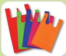
U-cut carry bags